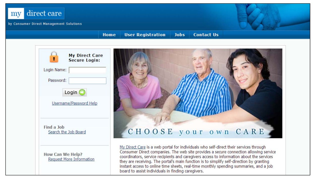
Figure 1. My Direct Care Home Page with Login

Note on terminology : My Direct Care uses the terms "Client" and "Participant" for Medicaid program recipients. In the descriptions below, the terms "Client" and "Participant" refer to the Participant enrolled in the Participant Direction Option program. The term Employer refers to either the Participant enrolled in the Participant Direction Option program or their Representative. The term Employee refers to the Direct Service Worker.