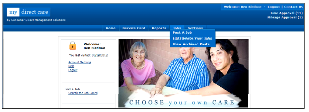
Figure 13. Job Openings Submenu

When a Job Poster hovers over the <u>Jobs</u> link on the top menu (Figure 13), three submenus become available, including Post a Job, Edit/Delete Your Jobs, and View Archived Posts.